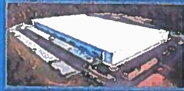
Charlotte Intermodal Logistics Center | Charlotte, NC