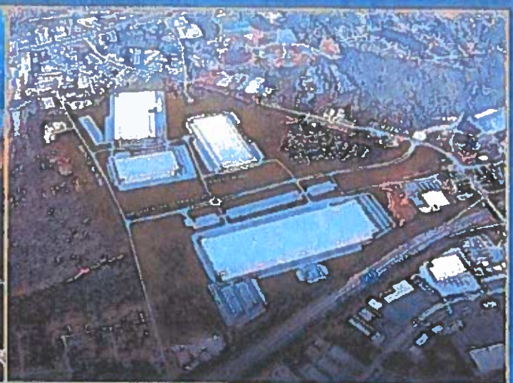
Douglasville, GA Over 800,000 SF of Warehouse/Distribution Developed, Proposed 1.7 Million SF of Additional Space