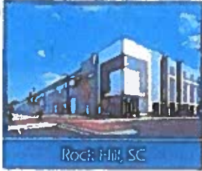
Rock Hill, SC