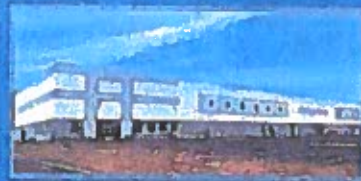
Ford Wireless Logistics Center | Ford, WA