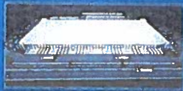
Foreign Trade Zone | Charleston, SC