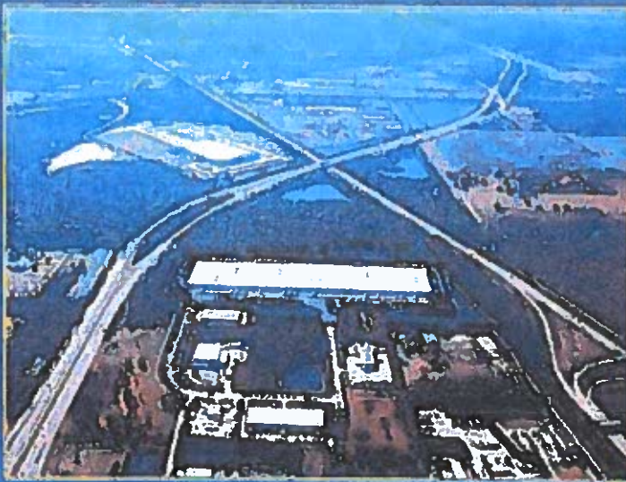
Fort St. Lucie, FL Proposed 1.1 Million SF Distribution Center