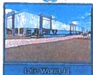
Lake Worth, FL