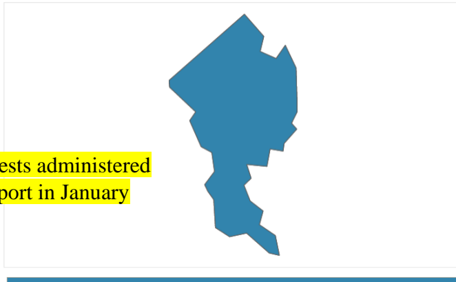
Rate of COVID-19 Tests Performed per 1,000 population, b..

263 Fewer tests administered Than last report in January